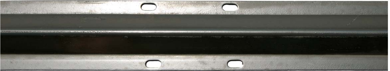
MIDDLE OF TRACK @ 10'